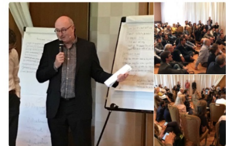
EU Agriculture & RD, European Commission, COPA-COGECA and 6 others