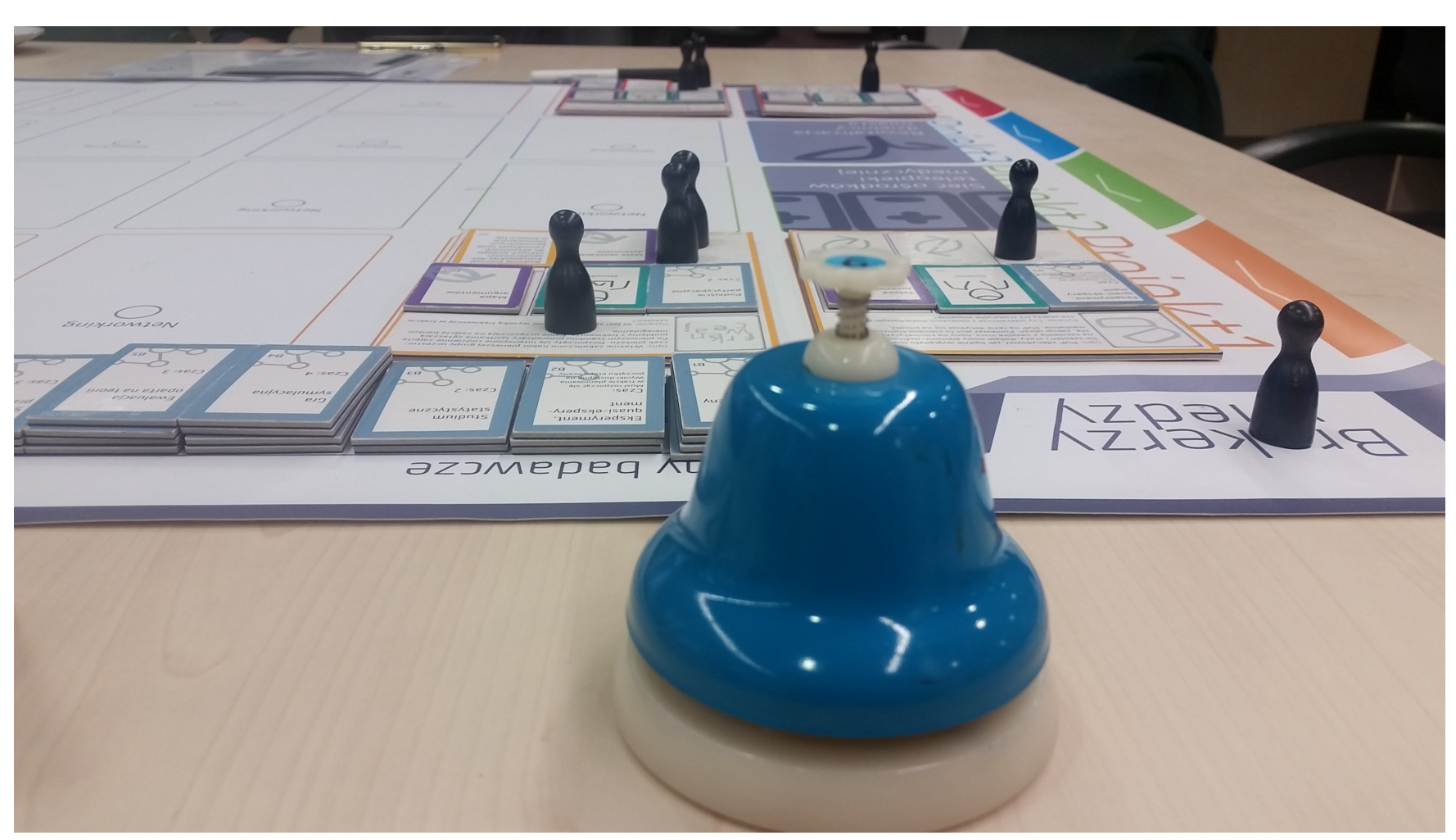
Simulation game used during the workshop on CLLD evaluation

The workshop's main goal was to share thematic and analytical knowledge and to facilitate collaboration between NRN partners in the scope of LEADER. It stressed the importance of montoring for the effectiveness of actions taken in the framework of CLLD in a practical way.