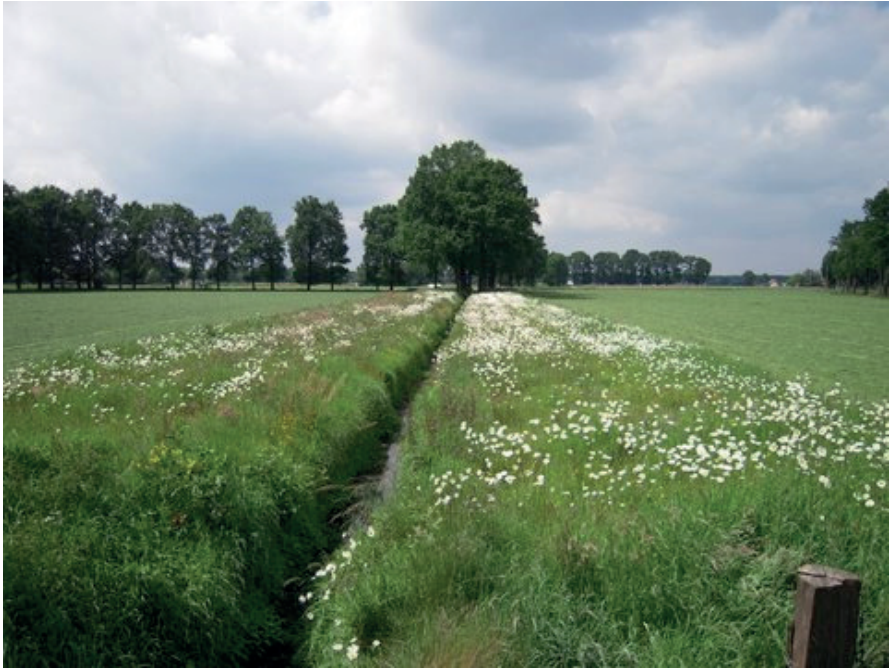
Photograph: A flowery embankment.