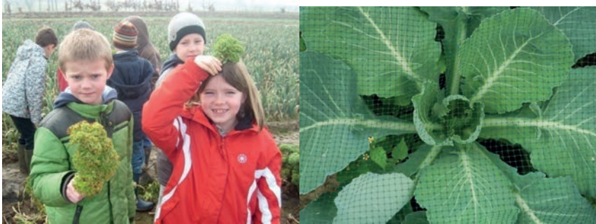
Photograph: Farm class.