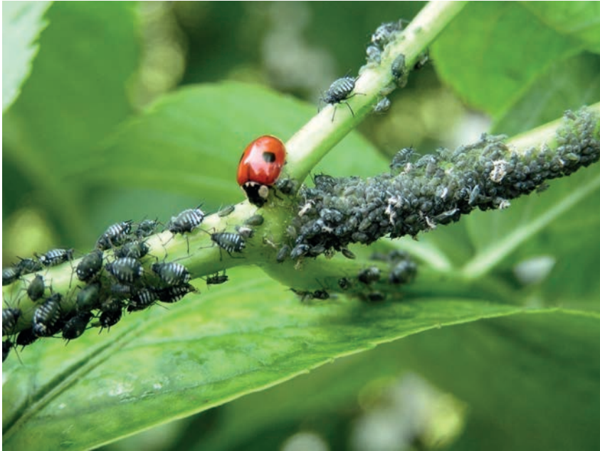
Photograph: Adult ladybug between an aphid colony.