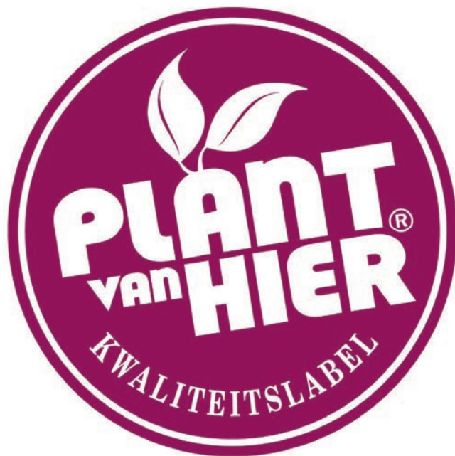
Photograph: Quality of an indigenous plant. (© RLH)