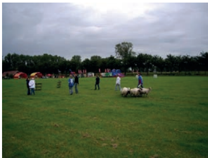
Photograph: Sheep trials.