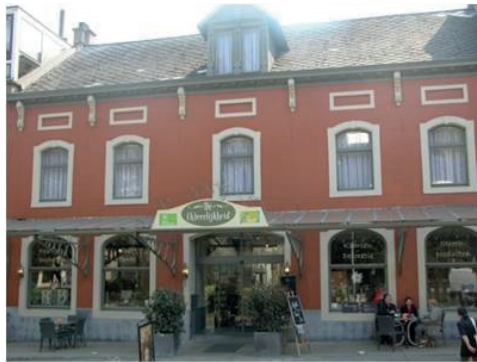
Photograph: Building after renovation.