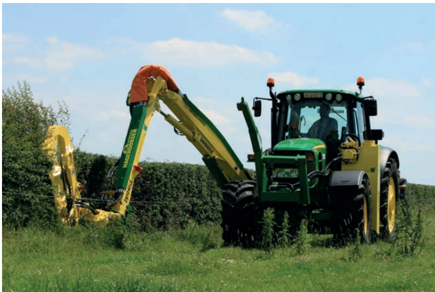
Photograph: Hedgerow thresher - rural hedges of at least 50 metres long are eligible for the pruning of hedges.