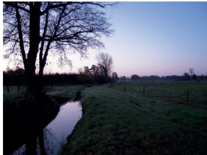
Photograph: Embankment in the morning.