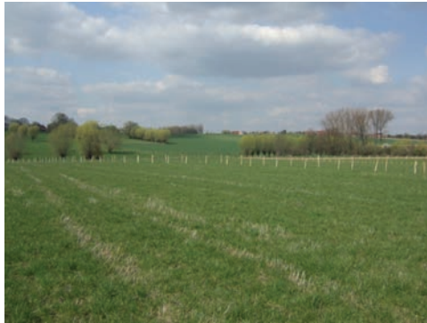
Photograph: Hedge (Bever).