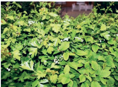
Photograph: Blossoming hawthorn in hornbeam.