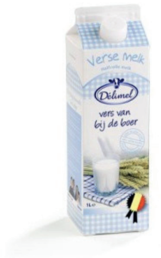
Photograph: Délimel packaging.