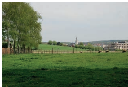
Photograph: Pressure of urbanisation in the Groebegracht Valley – encroaching building (including the hospital) in the landscape.