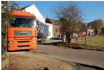
Photograph: Traffic pressure in the Groebegracht Valley - Beertsestraat - dangerous cycling conditions.