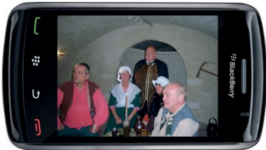
Photograph: A picture of the Jan De Lichte walk on a smartphone.