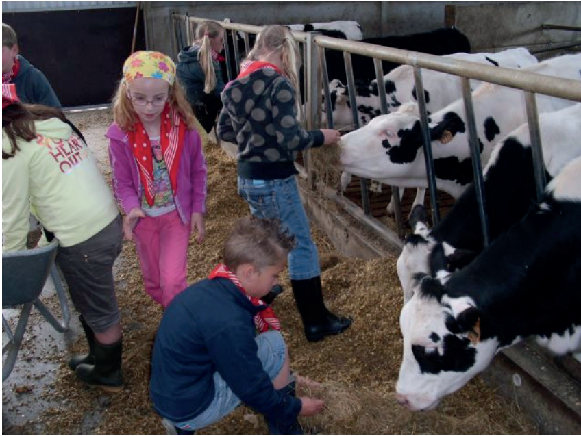
Photo: Visit to the local farm.