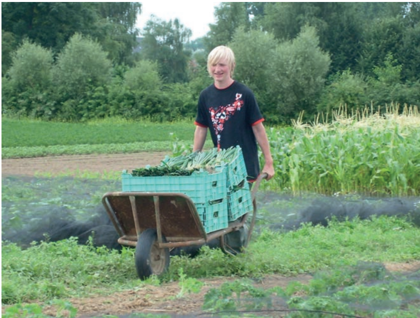
Photograph: Youth camp: active work outside is often a meaningful and fulfilling pastime for young people.