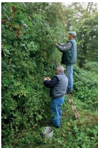
Photograph: Harvest of indigenous seeds. (© RLH)