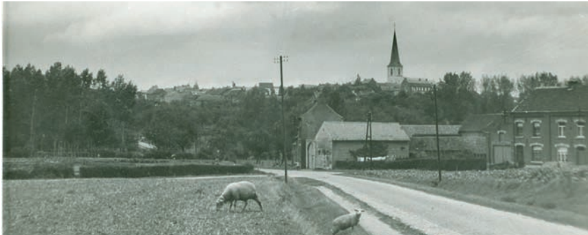
Photograph: The village of Borgloon is strategically located. Grazing sheep in the foreground. In the past grazing herds of sheep would err through the pastures with a shepherd.