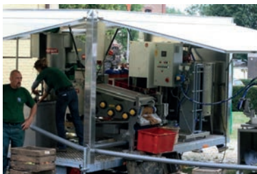
Photograph: Mobile juicer - apples are pressed into a vitamin-rich juice.