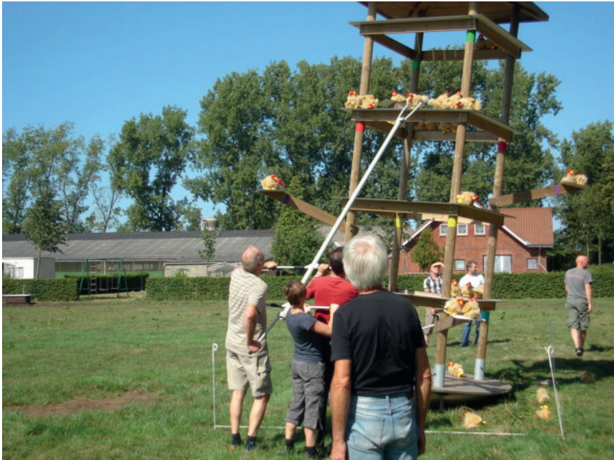
Photograph: Chicken game.