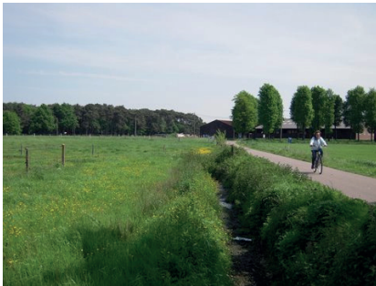
Photograph: Embankment along the cycling path.