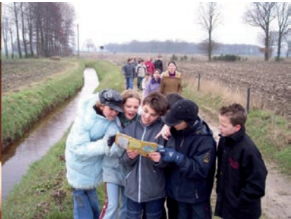
Photograph: GPS technology.