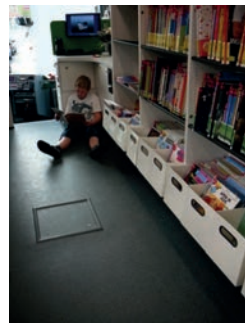
Photograph: Choosing from the amazing selection... and enjoying your read... on the bibus! (© Bibliotheek Zwevegem)