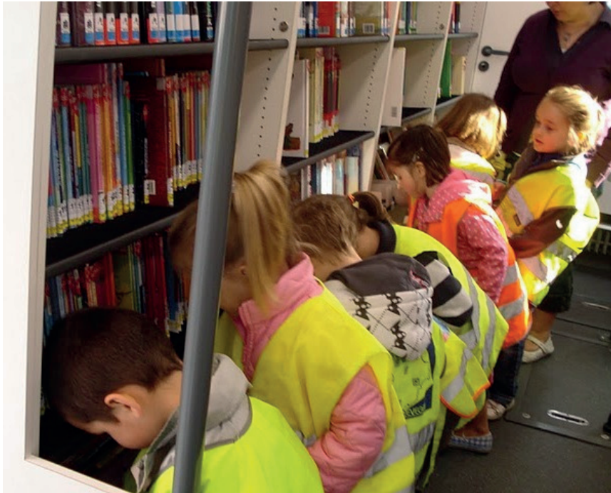
Photograph: The kindergarteners visit the bibus.