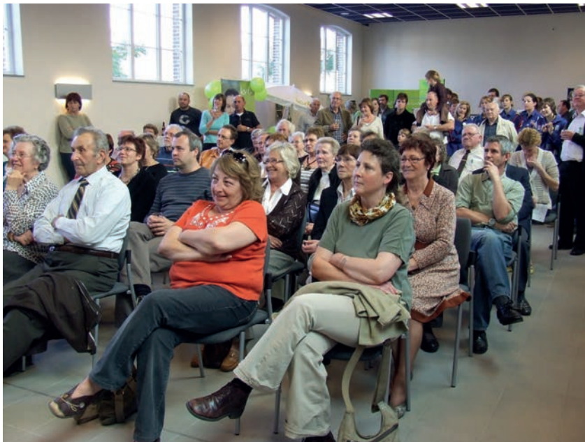
Photograph: Opening weekend.