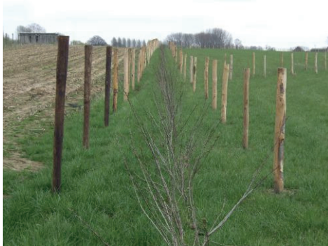
Photograph: Shelterbelt (Bever).