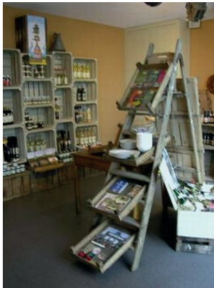
Photograph: Part of the offer in terms of local produce.