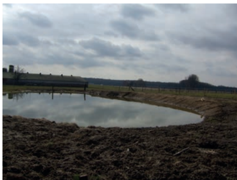
Photograph: Pool (Pepingen).