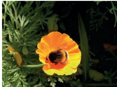
Photograph: Bumblebees collect nectar and pollen from flowers.