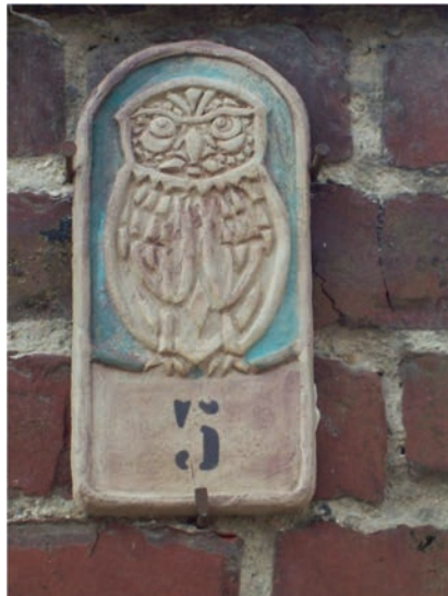
Photograph: Little Owl gadget.