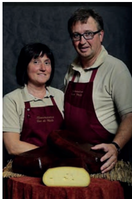
Photograph: Cheese from the Tielts Plateau.