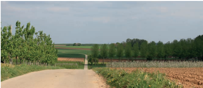
Photograph: The panoramic views from the Haspengouw plateaus are spectacular.