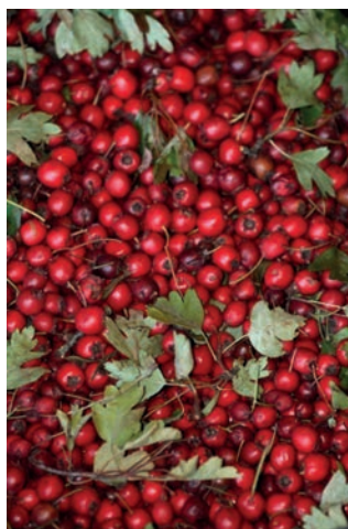
Photograph: Indigenous hawthorn seeds.