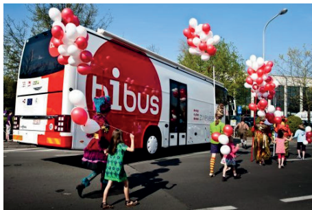
Photograph: The festive inauguration on 24 April 2010. (© rxja Harelbeke)