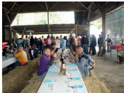
Photograph: BBQ in the barn.