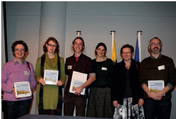
Picture: The four winning projects.

The four winning projects were honoured on 14 January 2011 during an event at the Agriflanders agricultural fair.