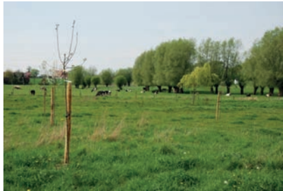
Photograph: Site building - planting of mixed hedges and a standard fruit orchard in the V. Demesmaeckerstraat.