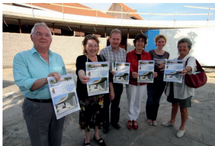
Photograph: Presentation of the newsletter.