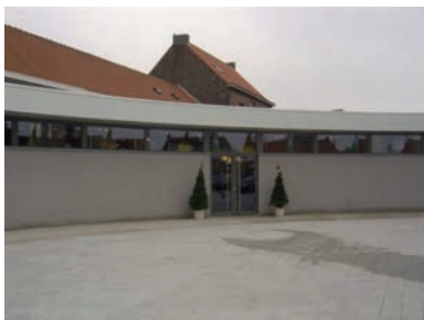
Photograph: Opening weekend.