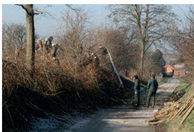
Photograph: Necessary maintenance in hollows in Sint-Truiden.