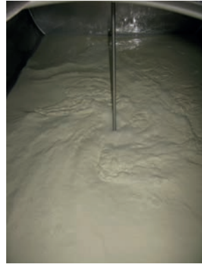
Photograph: Milk in a cooling tank.