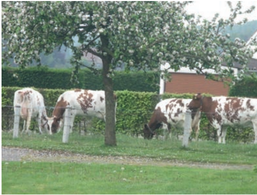
Photograph: Cows grazing.