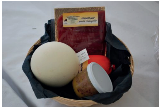
Photograph: Basket with local products.