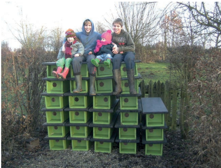
Photograph: Little Owl nesting boxes.