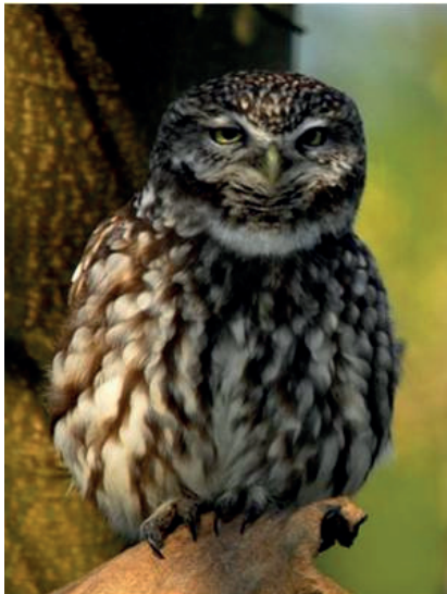
Photograph: Little Owl.