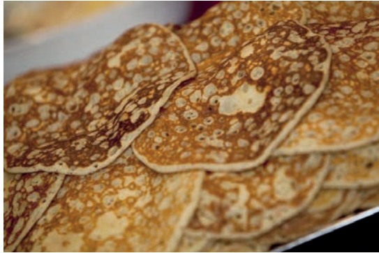
Photograph: Tielts pancakes.