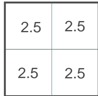
Area declared (or claimed)

Area declared (or claimed): 10 ha Area determined after controls before applying limits: 9.8 ha Area determined after controls after applying limits (area paid): 8 ha