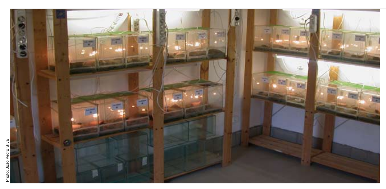
Juvenile viper in terrariums with warning lamps

photographed for future identification. Blood samples were collected to enable genetic screening and consequent assessment of the genetic "health" of the wild population. This also enables accurate geographic delimitation of rakosinensis subspecies populations from other V.ursinii subspecies populations, especially those found in potential contact zones such as the Danube delta (which belong to the moldavica subspecies).