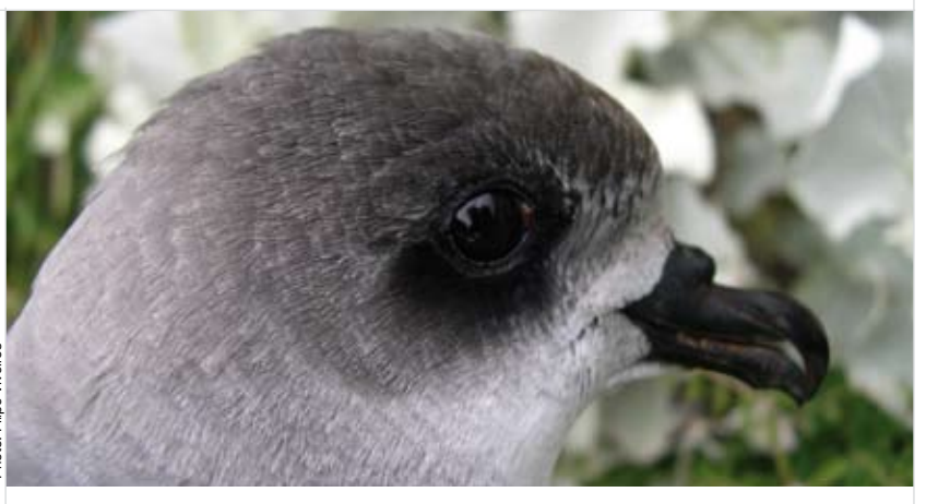
Zino's petrel (Pterodroma madeira) only breeds on Madeira island, Portugal

The project also planned to carry out surveys to improve the biologi-