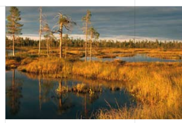
The project acquired more than 6 300 ha of land with mires, wet meadows and forests

LIFE's environmental legacies are matched by the socio-economic benefits that have been generated in relation