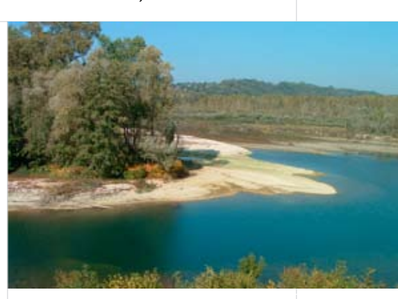
The project restored the Ain's natural river dynamics

The activities of the LIFE project had a directly beneficial impact on local biodiversity. The nightjar (Caprimulgus europaeus) and woodlark (Lullula