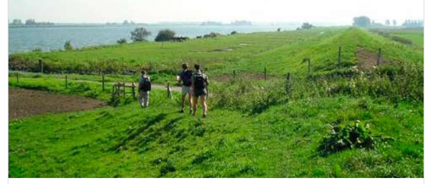
Polders were transformed under project actions, with the public being invited to test these modifications

The actions taken on the island are expected to boost the target species of the project including the sturgeon (Acipenser sturio - to be re-introduced at a later stage), the corncrake (Crex crex) and the bittern (Botaurus stellaris) as well as alder forests,