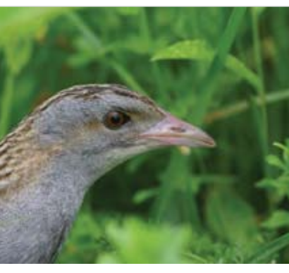
Corncrake (Crex crex)

A bird observatory was built at Ljubljansko barje using local and natural materials to integrate it into the wet grassland landscape in a sensitive and discrete fashion. The same design principles could now be applied to other visitor infrastructure within the Ljubljansko