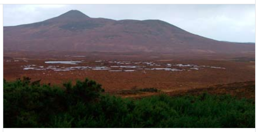
The project benefited more than 16 000 ha of blanket bog in total

The project was led by the Royal Society for the Protection of Birds (RSPB) the