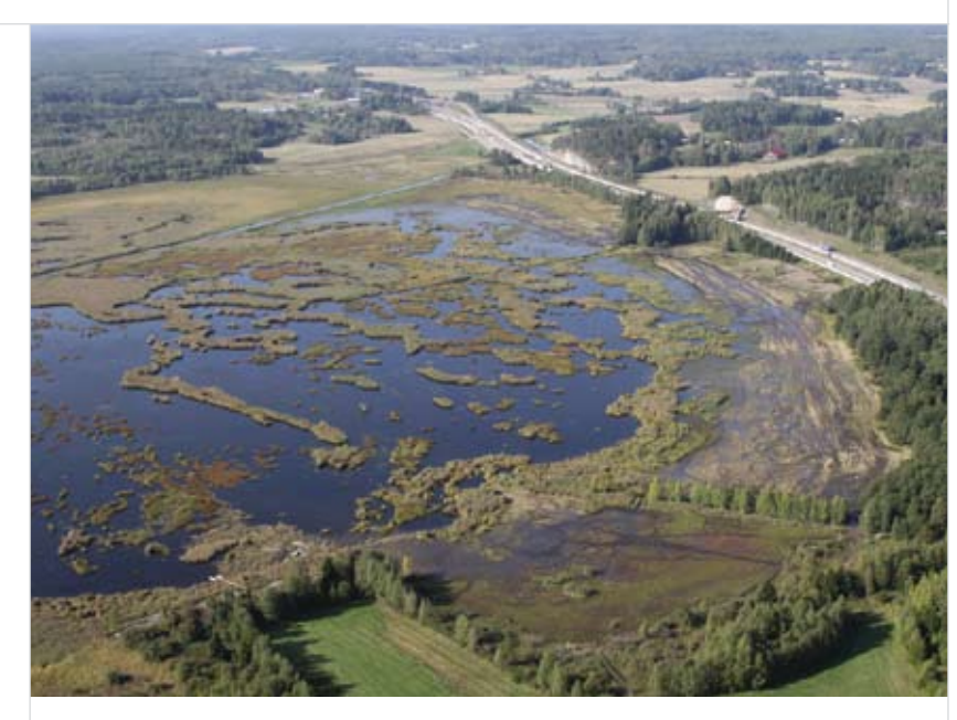
These coastal meadows were restored by mowing

The LIFE Nature Gulf of Finland project focused on 12 specific sites along this flyway, covering a total of 3 630 ha. All are considered internationally valuable bird-rich wetlands by virtue of the fact that they host 35 species mentioned in Annex I of the Birds Directive. Important species such as the whooper swan ( Cygnus cygnus ), the whistling swan ( Cygnus cygnus ) and the smew ( Mergus albellus ) use these sites as resting areas.