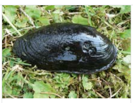
The project targeted the last population of water pearl mussels in Belgium

These efforts highlighted 600 problem areas. Based on these findings, the project then implemented a series of management initiatives to tackle the problems in key target areas, and solved the most urgent ones.