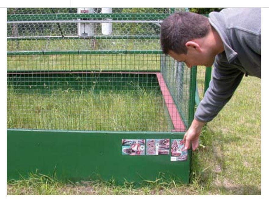
Viper enclosures in the captive breeding centre

ages. Moreover, the project established a viper identification methodology using photographs of each viper's head – the scales and markings are unique to each individual.