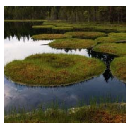
480 ha of raised bogs and aapa mires were restored by the project

The knowledge acquired was used to prepare long-term management plans for all the project sites and six mire/ forest restoration plans. Local people were engaged in the planning process, participating in the planning group, at public meetings and in media initiatives - 16 press releases were drafted resulting in 45 press articles about the project. Site brochures were produced for three areas (Koitajoki, Kolvananuuro, Petkeljärvi-Putkelanharju) and thematic pages were created for the project's website on ravines and geomorphology, mires, boreal forests and eskers. In addition, 16 public events and 17 expert events were organised, attracting some 1 050 participants. Though engaging the local community in the project was time consuming, it helped foster a greater acceptance