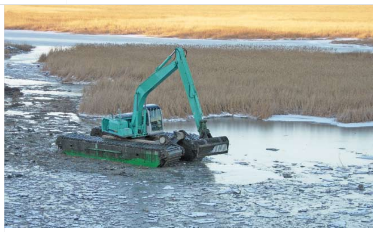
Specially adapted machines were used to help restore the coastal reedbeds

The project also included the creation of small water ponds in the middle of the coastal meadows in order to provide habitat for wetland-dependent insects, such as the large white-faced darter.