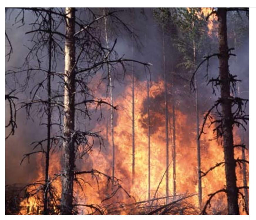
Fire has proved to be a very powerful forest management tool

This Finnish LIFE Nature project developed some unusual techniques for restoration of forest biodiversity in a ground-breaking partnership between the public sector, private sector and army.