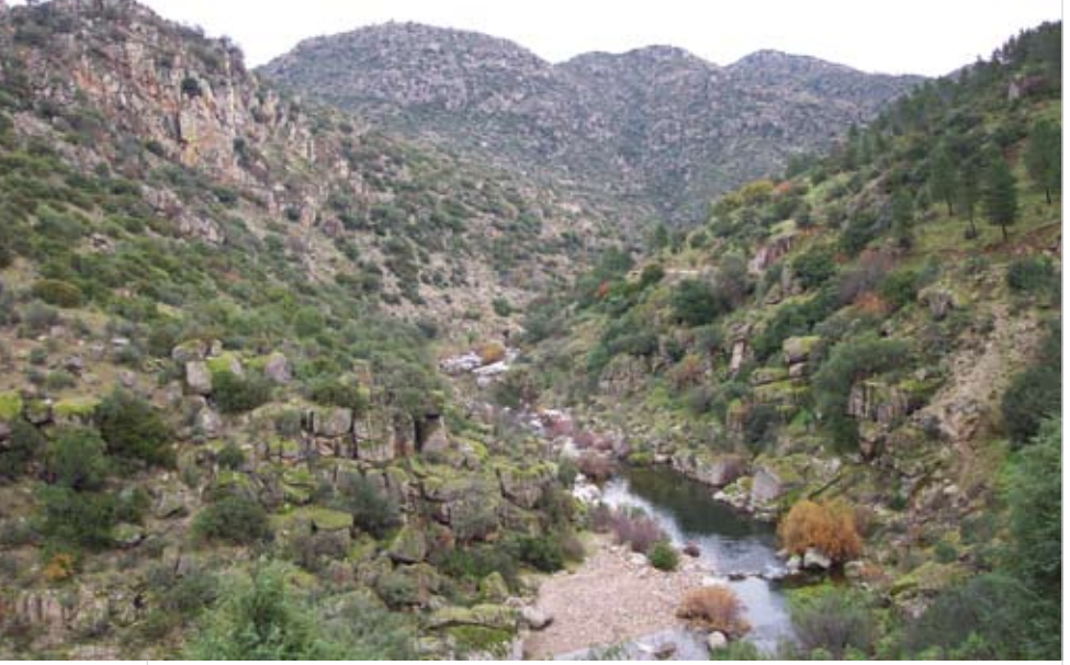
The area of habitat available for the lynx has been reduced by human activities

stations were created where rabbits were introduced without available warrens for their protection. However, this was limited so as not to affect normal feeding behaviour.