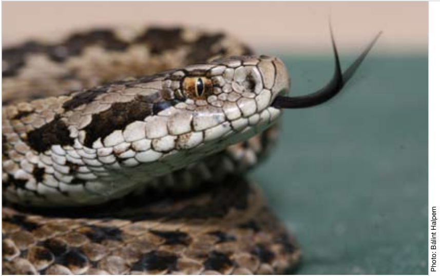
Hungarian meadow viper (Vipera ursinii rakosiensis)

LIFE Nature has given the Hungarian meadow viper an important boost. This project has taken key steps towards the long-term conservation of the most endangered snake in Europe.