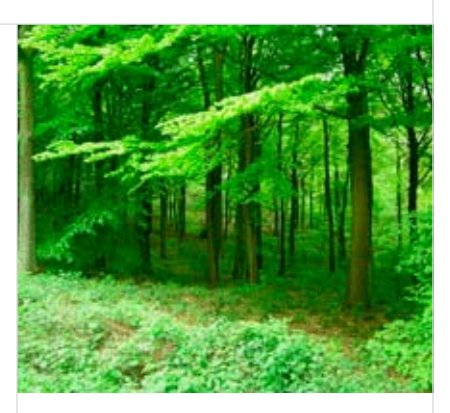
Limited of management of woods encouraged the rich herb layers to develop

Another important success of the project was the involvement of volunteers and local stakeholders and regular and positive collaboration with public authorities, communication with the general public and collaboration with farmers. Such co-operation has continued after the end of the project. An after Life conservation plan set out a staffing structure and land-purchase strategy for the future. In addition, provincial authorities have decided to finance the restoration of a stable