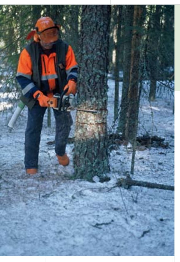
The project opened small clearings in the forest using diverse methods, such as explosives and chainsaws

park and private forest together. The creation of the national park in 2003 was also a public-private collaboration, since UPM donated 560 ha of its land to enable it to happen (under Finnish legislation, national parks must cover at least 1 000 ha).