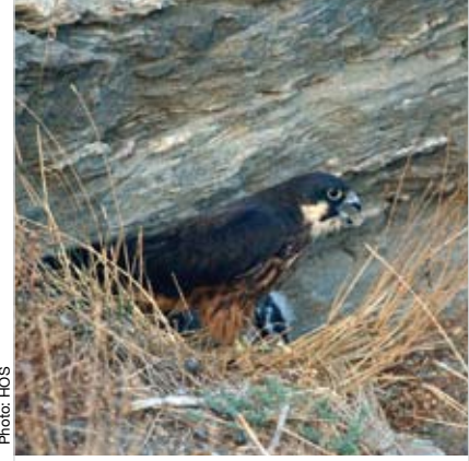
Eleonora's falcon (Falco eleonorae)

A number of measures were put in place to meet these aims. The first complete colony survey, to estimate and map the breeding distribution of