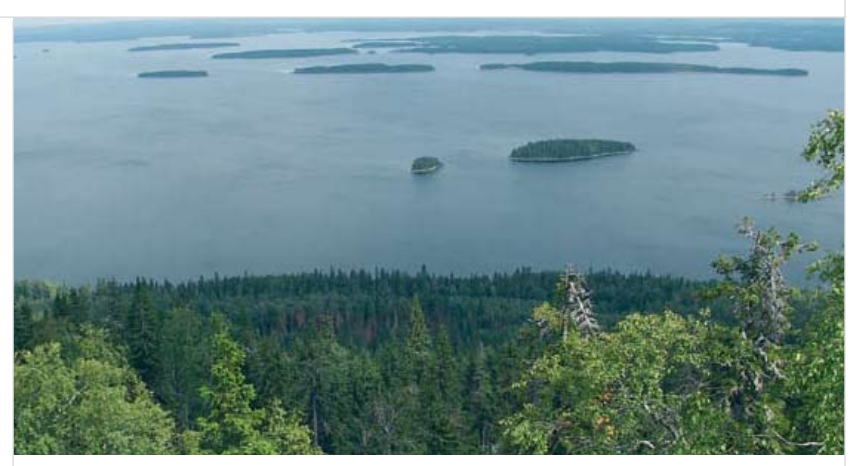
The project draw up long-term management and restoration plans for the habitats of the national park

The project reached its targets, developing and beginning to implement