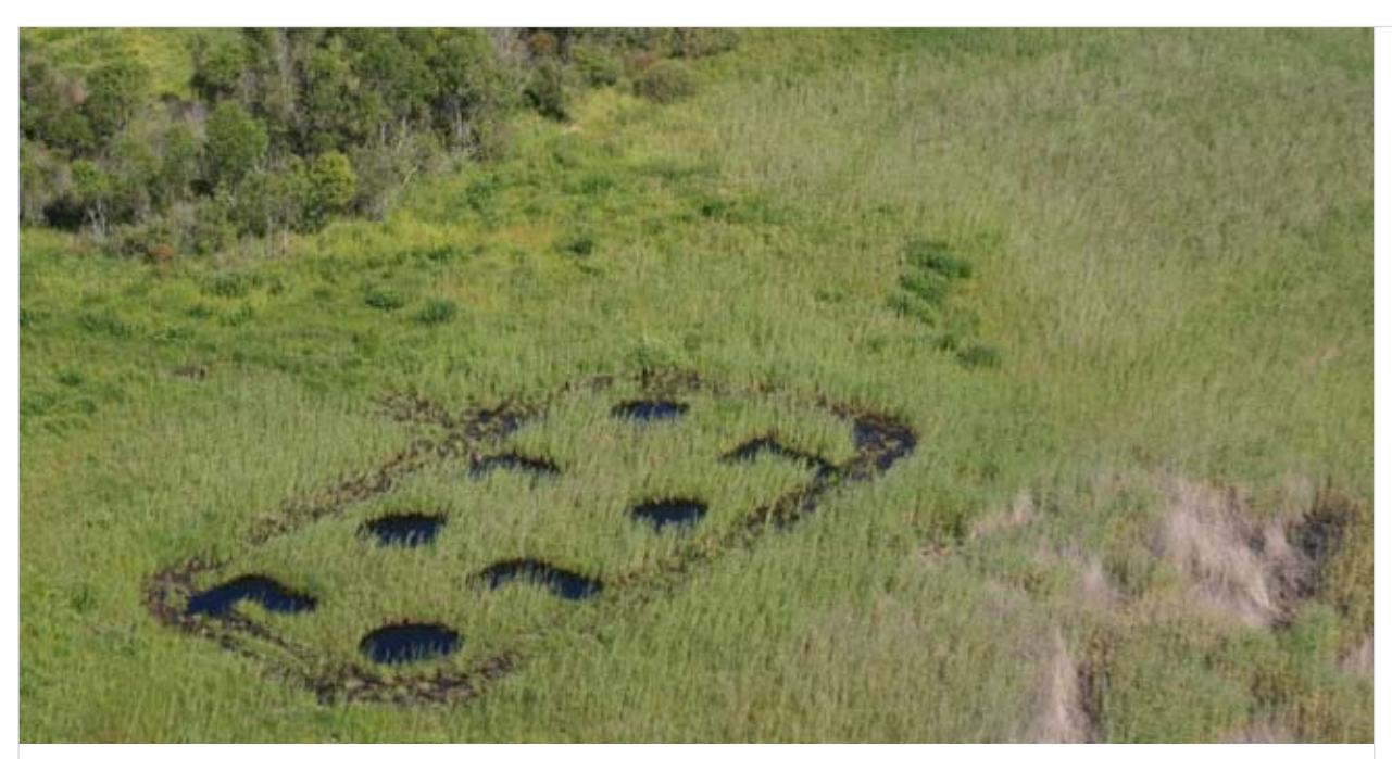
Mowed area and restored ponds for dragonflies

development of management plans for Natura 2000 sites in close consultation with experts, local inhabitants and landowners. By involving all these different stakeholders, the project sought to resolve potential or existing conflicts between conservation and other land uses.