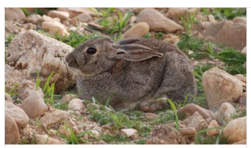
Rabbits make up 95% of the diet of the Iberian lynx

regional government of Andalusia. These partners importantly included organisations representing hunters and landowners, as well as environmental NGOs.