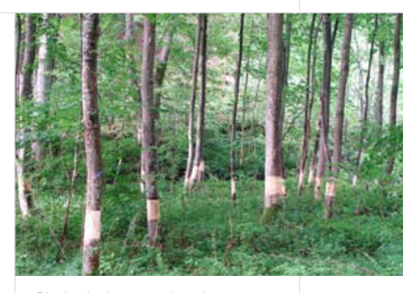
Ringing bark was used to phase out spruces gradually

The control measures targeted at species such as spruce and birch made an important contribution to the survival of the natural deciduous forest habitats. Scarification activities penetrated the thick grass layer in some areas allowing regeneration of natural forest habitats, and supporting the survival of new saplings. Fencing effectively protected the seedlings, and had a positive effect on