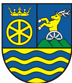
TRNAVA SELF-GOVERNEMNT REGION